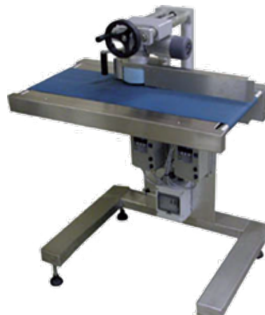
Pack turning unit