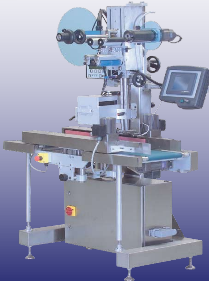
Premier 100 C-Wrap Food Labelling System