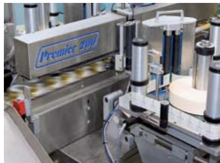
Premier 200 running at 350cpm at local preserves manufacturer