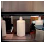
Top stabilising belt