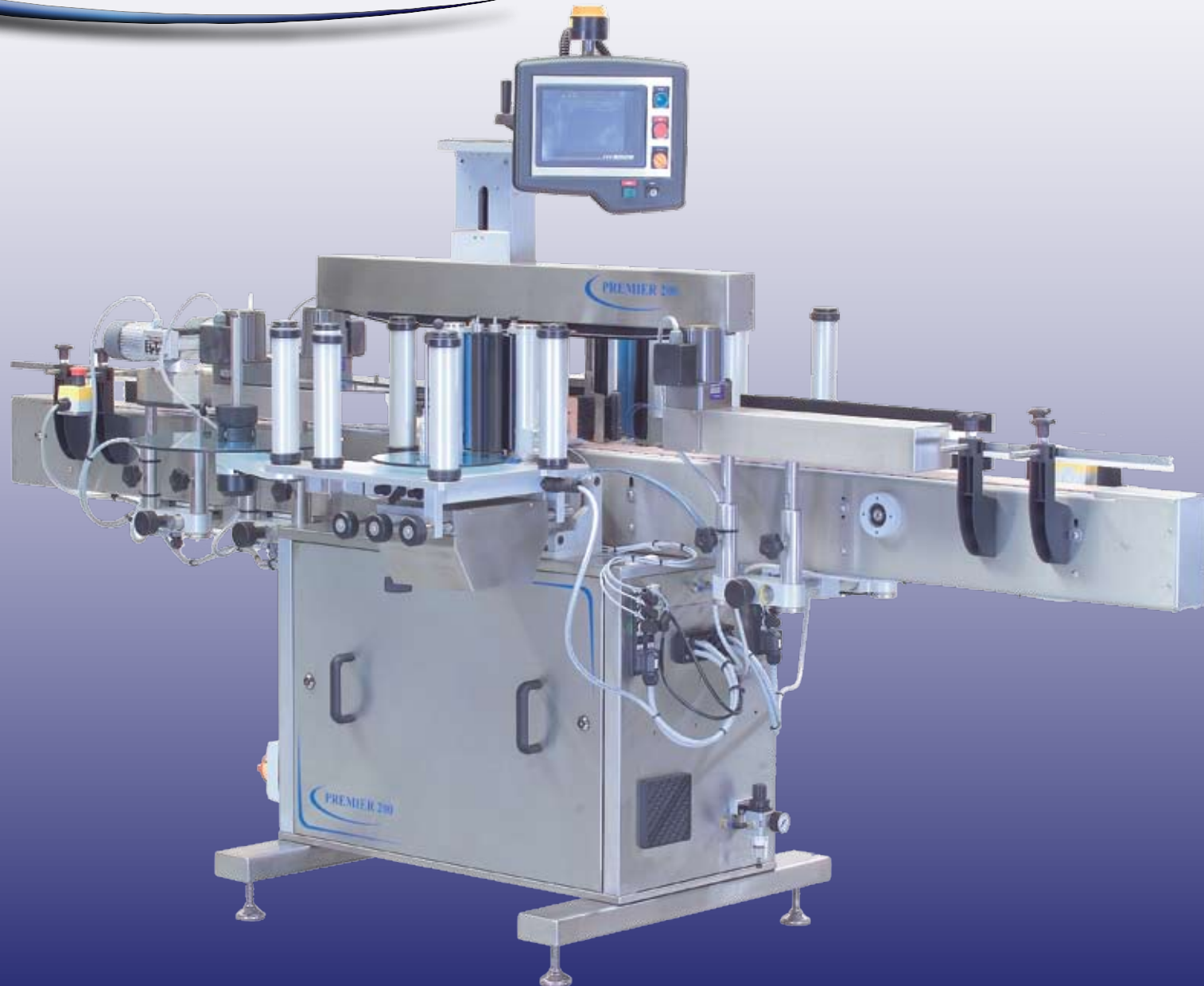
Premier P200 Labelling System