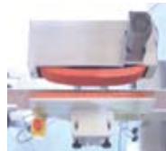
After-roll unit for wraparound labels