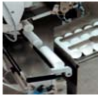
Tube feed system