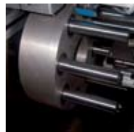
Tube roller mandrel