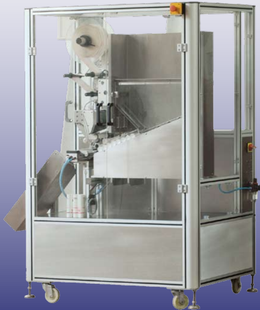
Premier P500 Tube Labelling System